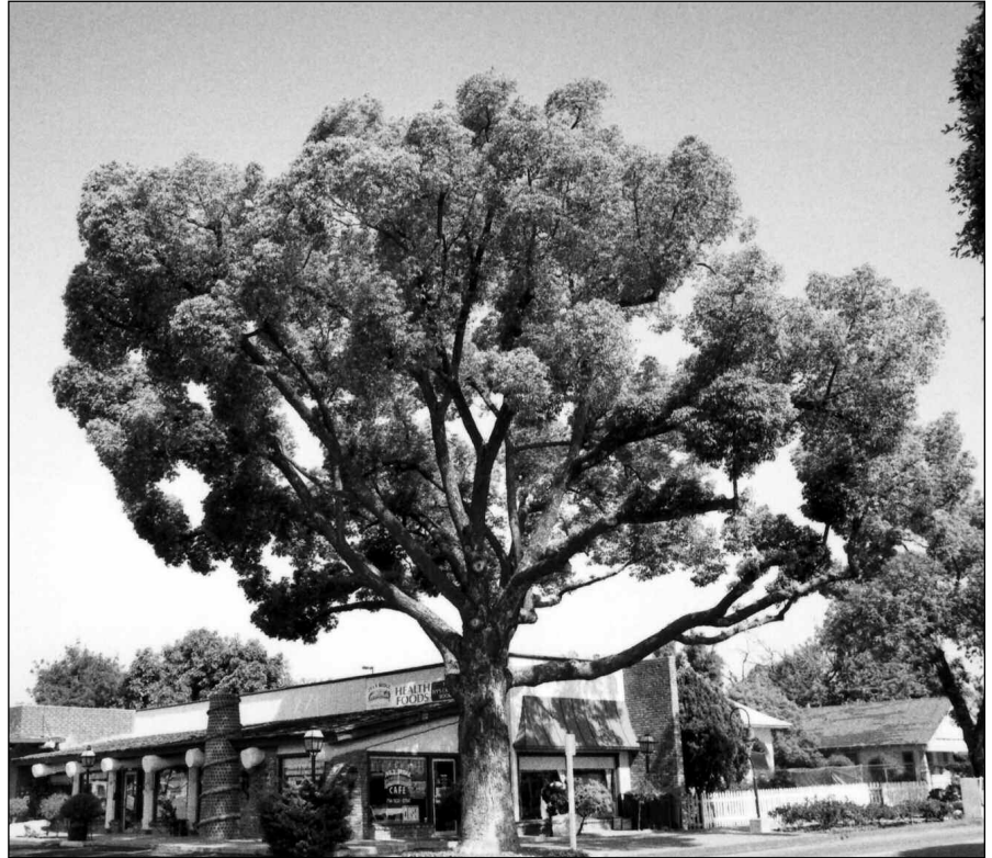
Camphor tree located in front of Jamestown Village on El Camino Real, age range 100 years. Jamestown Village was built in 1961.